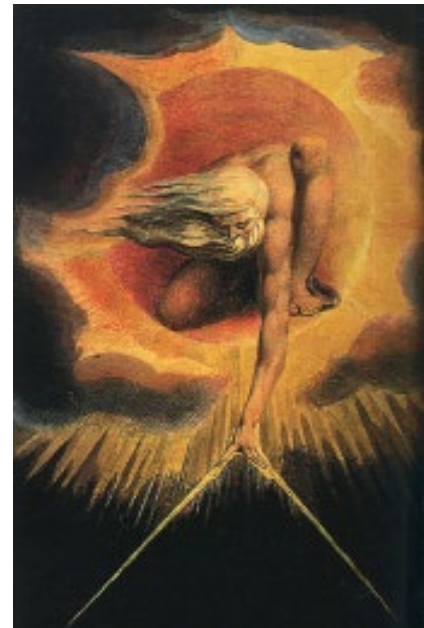
William Blake's Ancient of Days (1794)