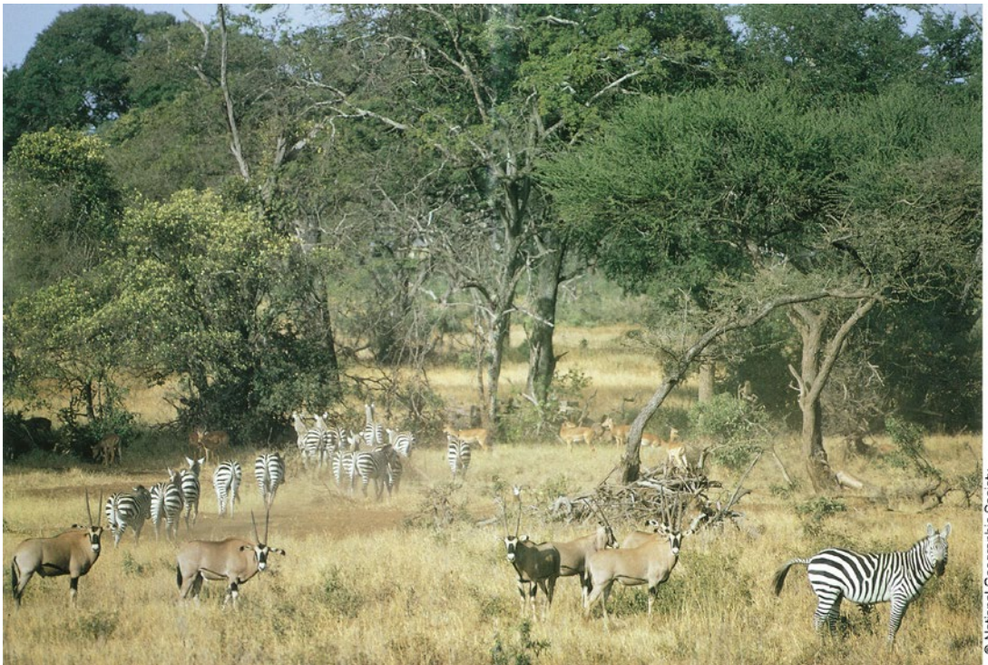
Africa—our soul's home—the Garden of Eden

And, MOST WONDERFULLY, biology is now finally able to provide this dreamed-of, exonerating, 'good-and-evil'-reconciling, 'burden-of-guilt'-lifting and thus psychologically rehabilitating EXPLANATION OF THE HUMAN CONDITION—thereby making it possible to safely admit the truth about our species' innocent, soul-full past! (It should be mentioned that this explanation of our species' present deeply psychologically embattled condition is not the psychosis-avoiding, trivialising, dishonest account of it that the biologist E.O. Wilson has put forward in his theory of Eusociality, but the psychosis-addressing-and-solving, real explanation of it.)